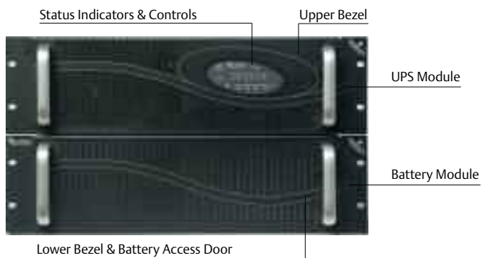
Lower Bezel & Battery Access Door